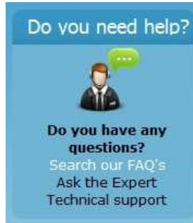
Figure 5. "Need Help?" block of the Ergo/IBV application