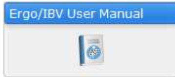
Figure 4. Access to Ergo/IBV User Manual from the Occupational Health Community

When the manual chapters are dropped down, select the chapter related to the module or option where you encountered the problem, and review the information provided.