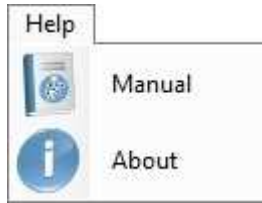
Figure 3. Access to Ergo/IBV User Manual (help menu)